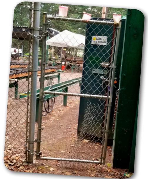
Vandalism above — repair below.