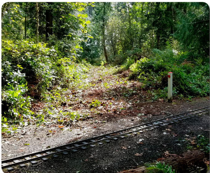
Brush busting complete for the day.