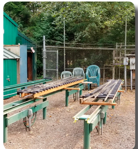
Below L & R remote switches ready for install.

See the full track map at www.kitsaplivesteamers.org