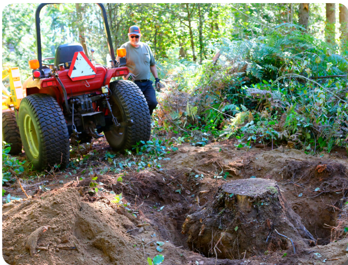
Another stump that does not want to come out!