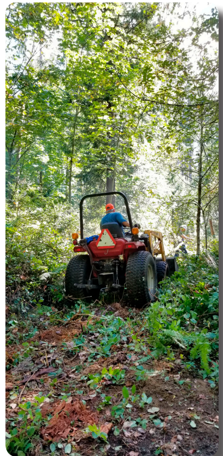
Above NW leg brush busting.