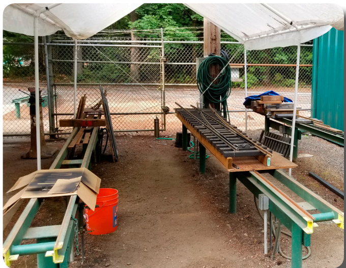
Yard kicks switch finished and ready for install.