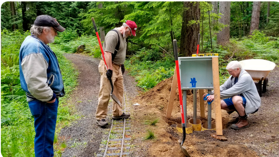
Signal Box Install