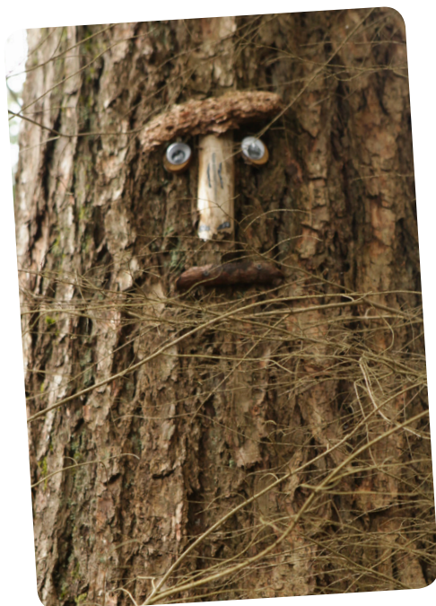
The trees watching the trains running through the forest!

1360 SW Pine Road Port Orchard, WA 98367-7796 woodturner365@gmail.com 619-540-3580