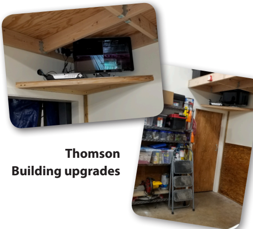
Thomson Building upgrades

See you at the annual meeting on January 26th, or at the park.