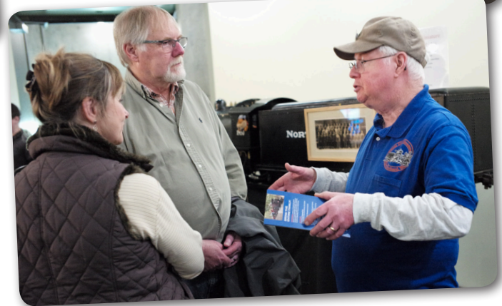
A sampling of members sharing their knowledge with visitors. Thanks to all who participated.