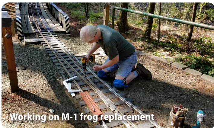
Working on M-1 frog replacement