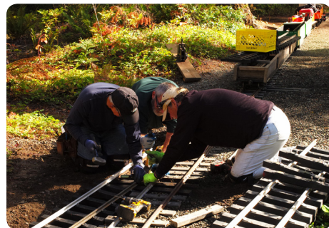
Laying new Y-track at the switch

The second switch for the wye, to be installed on the mainline north of the entrance to the middle loop, will be built next, and once that is done, the final 100 or so feet of the wye track will be laid. A big thanks to Tom, Don and Dan, for their continuing dedication to the KLS track.