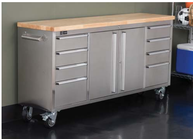
New Tool chest