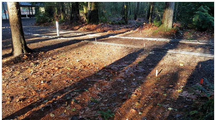
Derail Grade Crossing