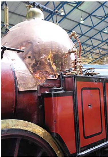
This view of the 1846 steamer shows several shrapnel holes caused by the German bomb.