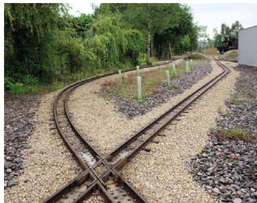
Miniature railroad diamond crossing.