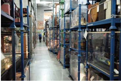
The aisles of the 'Warehouse' seemed almost endless.