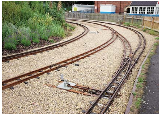
The miniature railroad passenger loading area.