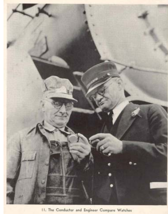
11. The Conductor and Engineer Compare Watches

Summer is just about over. If all goes well, we will have a record breaking year. Only three scheduled run days left and of course the Ghost train to end our season.