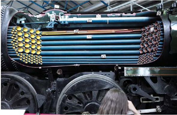
A fabulous cutaway showing the tubes inside the full size boiler.