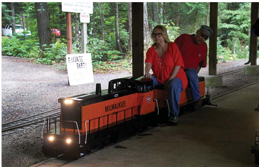
Our new engine at Friends and Family