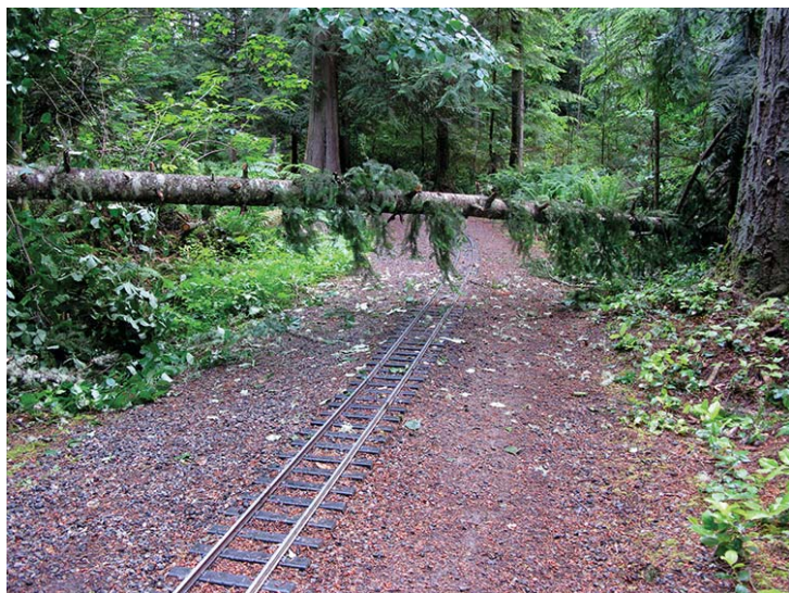
Clean up of downed trees