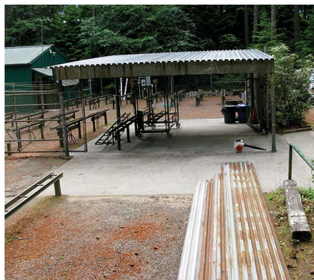
We have a new cover over the transfer table. Thanks to those who did a great job.