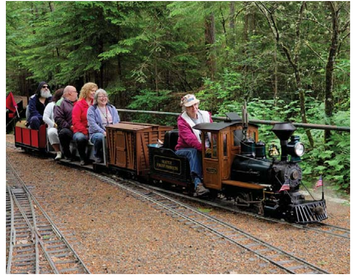
All Aboard with a group of Special Needs kids and a group of Preschool kids.