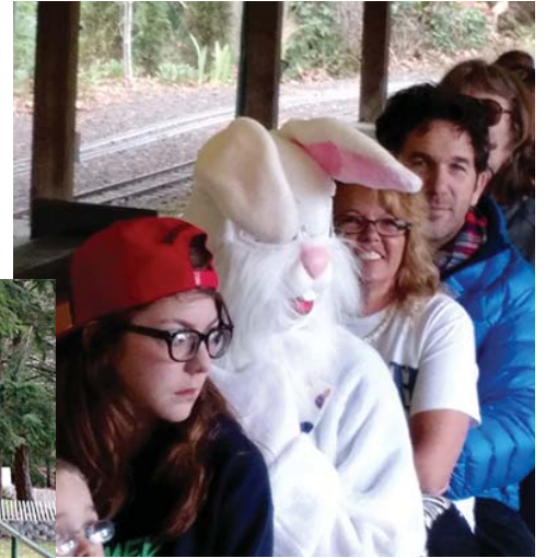
Easter Run and Opening Day