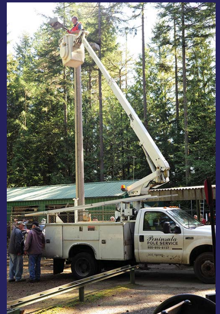
New 50 Watt LED's have been installed.

Thank you to those that have already renewed and thank you for the donations.