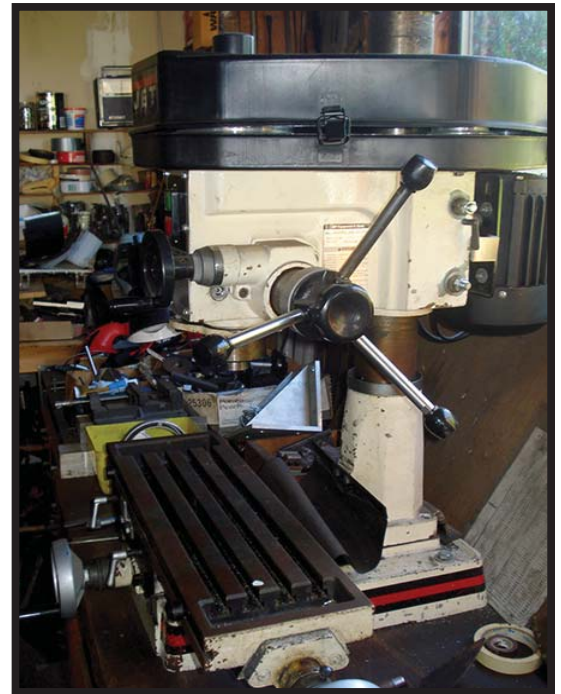
Jet Mill Drill Model JMD-15 plus tooling. Jet Band Saw/ Cut off Saw. Lots of nuts, bolts and stuff for trains. Engine Hoist

Interested Call Bob Fuchs at 253-631-8377.