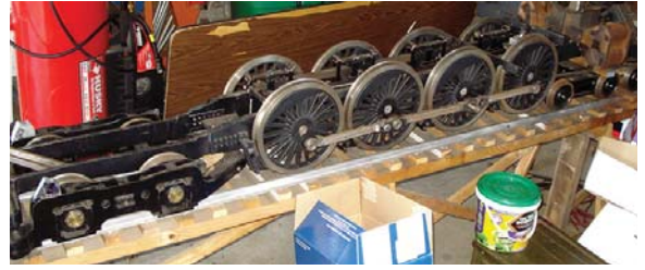
Tender truck wheels turned and mounted on shafts. Several castings for engine and tender plus prints.

Have you been looking for that special custom railroad font or other specialty work for your engine or cars? Well we have it in white, black, gold colors. Additional colors might be available. Contact Dennis Weaver (360) 871-6414