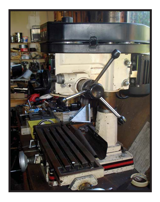
Special Sale of KLS Shirts

"Get them while they last! Adult KLS Shirts on sale $5.00 each. The larger sizes listed in the past for as much as $26.00! There are a few grey t-shirts left and lots of polo shirts in blue with and with out pockets,"