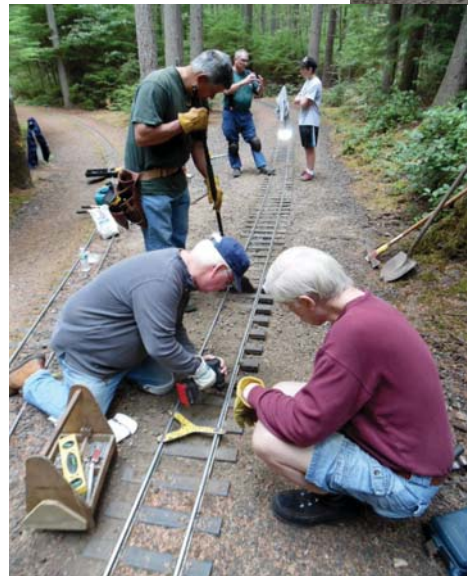
Special Work Day