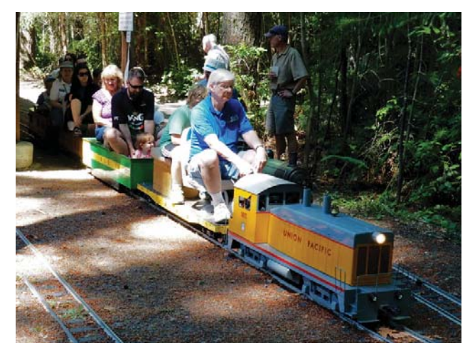
Thanks to all that took photos of Friends and Family. Look for more next month.