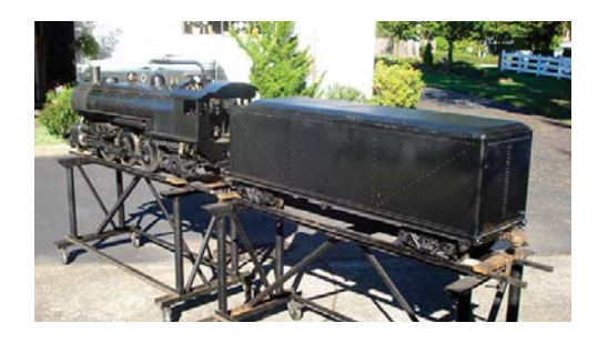
Pacific 4-6-2 Locomotive complete and running with prints. Passed all tests for 10 years. Steel boiler and tubes.

For Sale: Bob's Two Trains 7 ½ inch gauge, 1 ½ inch per foot.