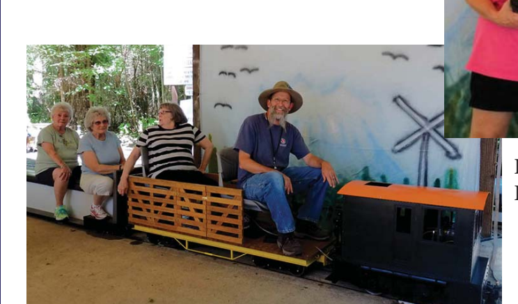
Friends and Family Photo taken By Alan

There are 5 more rundays. We still need your help. Please consider helping. Not sure what to do? Please ask Ken Olsen.