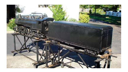
Pacific 4-6-2 Locomotive complete and running with prints. Passed all tests for 10 years. Steel boiler and tubes.