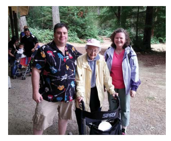
The YOUNG lady in the middle is 101 years old. Perhaps the oldest person to ride our trains.