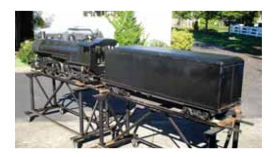
Pacific 4-6-2 Locomotive complete and running with prints. Passed all tests for 10 years. Steel boiler and tubes.

For Sale: Bob's Two Trains 7 ½ inch gauge, 1 ½ inch per foot.