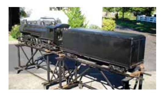
Pacific 4-6-2 Locomotive complete and running with prints. Passed all tests for 10 years. Steel boiler and tubes.

For Sale: Bob's Two Trains 7 ½ inch gauge, 1 ½ inch per foot.