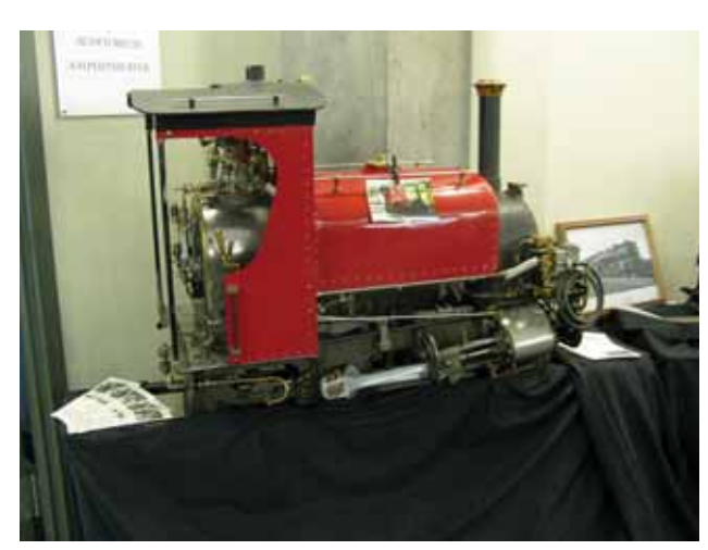
Conrad Watne's engine